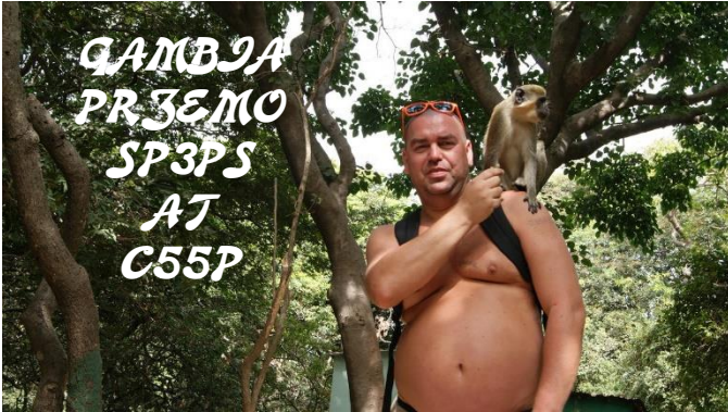
THE GAMBIA, C5. Przemo, SP3PS is QRV as C5SP until mid-March. Activity is on 20 to 10 meters using SSB and FT8. QSL to home call.