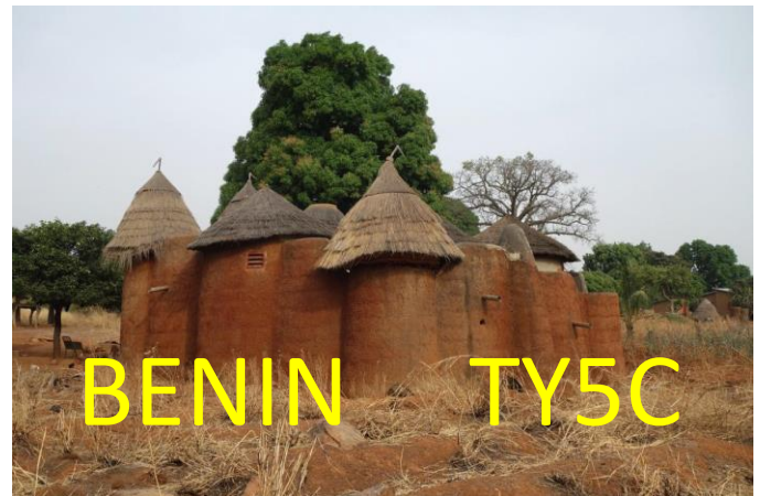
BENIN, TY. Gerard, F5NVF is QRV as TY5C from Godomey until April 2. Activity is holiday style on 80 to 6 meters using CW, SSB, and FT8. QSL via F5RAV and LoTW.