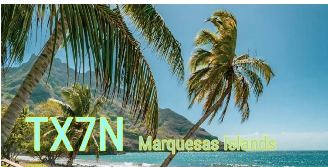
MARQUESAS ISLANDS, FO. A group of operators are QRV as TX7N on the HF bands, and TX7MAS on 70 centimeter Satellites and 23 centimeter EME. They will also be active as TX100REF in the upcoming CQ World Wide 160 Meter CW contest. QSL via LoTW.